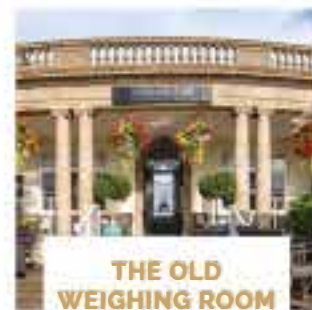
THE OLD WEIGHING ROOM

Max cabaret style = 200 Max theatre style = 250