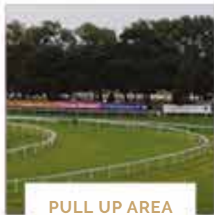
PULL UP AREA

AS ONE OF THE LEADING SPORTING AND ENTERTAINMENT VENUES IN YORKSHIRE, DONCASTER RACECOURSE ATTRACTS AN AUDIENCE OF OVER 450,000 VISITORS EACH YEAR.